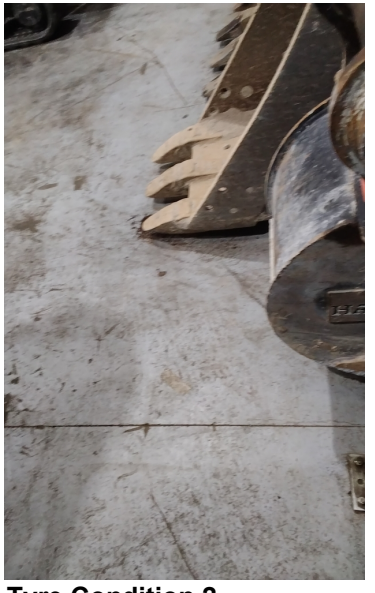
Tyre Condition 2